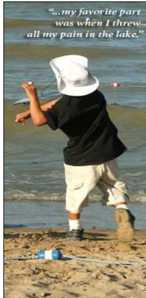
"...my favorite part was when I threw all my pain in the lake."

Detroit Free Press matches our clubs $2,000 enabling a total of 8 children to attend camp this year!