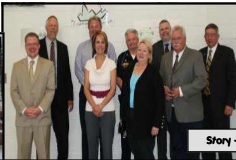
Story - Page 3