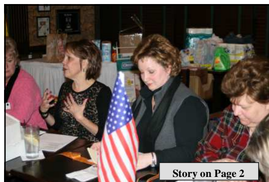
Story on Page 2